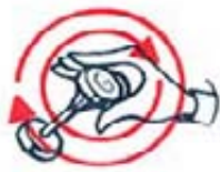
RIGHT TO CLOSE