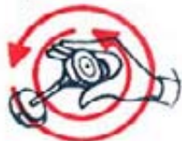
LEFT TO OPEN

Fuel Valve and Filler Cap must be closed firmly. Turn Pump Plunger two turns to the left. Place thumb over small hole in end of Pump Plunger and pump 35 to 40 full strokes of air into lantern. Good pressure is important. Now turn Pump Plunger clear to right until tight and push it clear down. Oil Pump Leather occasionally to keep it soft and pliable.